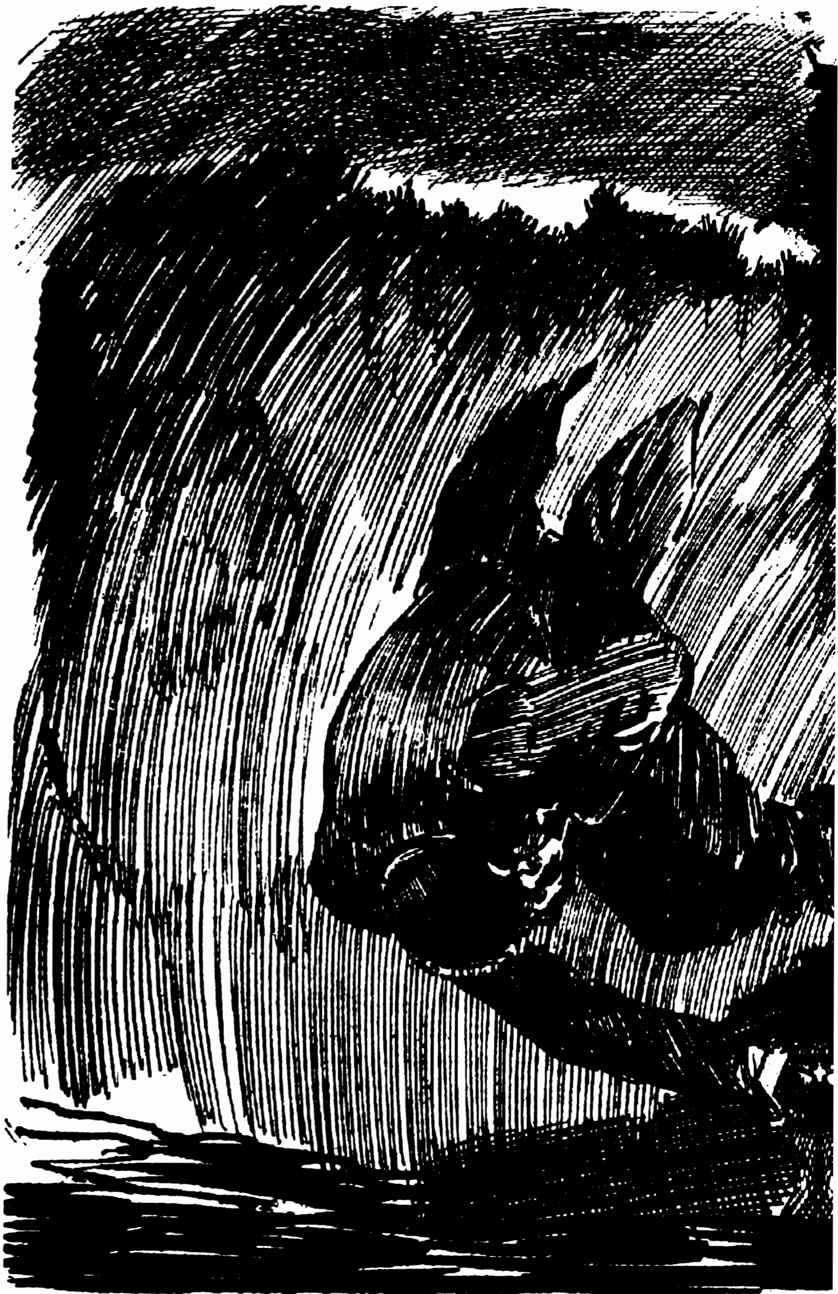
Even as Lee staggered blindly across the dark— plunged helplessly into the

He pressed a bell, and the office boy appeared as if by magic.